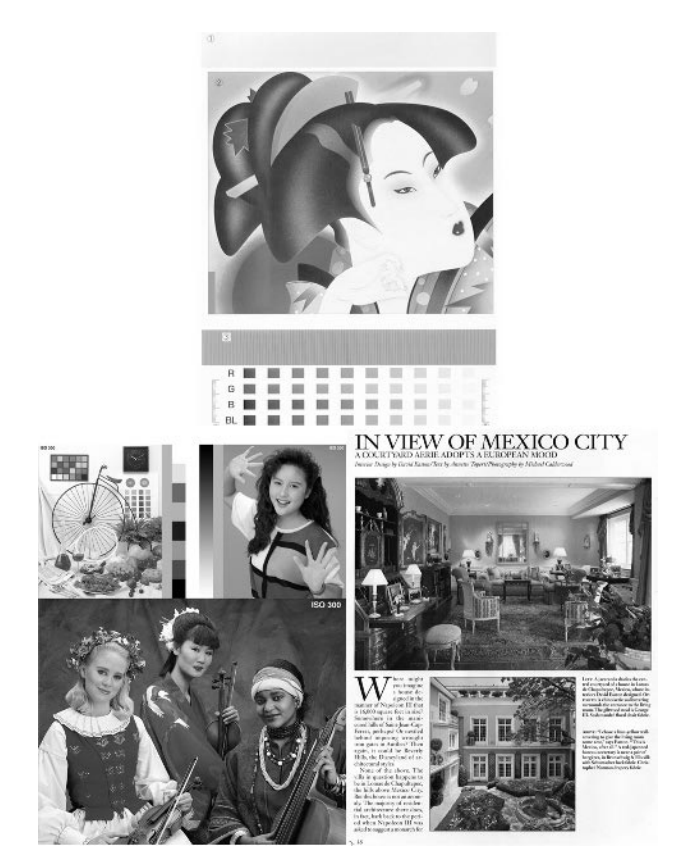
Figure 4. The three images used in the experiment. Top: 11, a test target provided by an MFP manufacturer. Left: 12, a composite image created using SCID24 images, printed on a continuous-tone Fujix Pictography printer. Right: 13, a mixed-content page taken from a magazine.

The images were viewed under Cool White Fluorescent light, using a GretagMacbeth SpectraLight 3 light box.