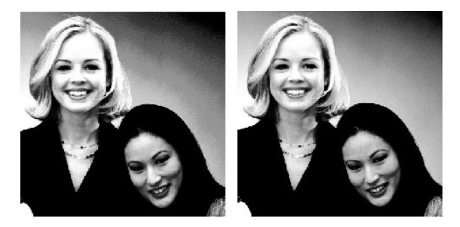
Figure 2. A natural color image processed through two different ICC profiles. Banding artifacts due to a "bad" profile, are apparent in the background of the left picture.

Smoothness means that there should be no abrupt steps in the LUTs — the values should vary smoothly in the entire LUT. Violating this typically leads to visual artifacts such as banding and 'false contours,' especially visible in so-called color ramps (also known as gradations or sweeps). These typically occur in backgrounds of business graphics, but also in natural scenes, see Figure 2. Olson<sup>14</sup> has discussed this issue. Especially when the gamut differences are large, it is necessary to perform a trade-off between correctness and smoothness. A good gamut mapping algorithm need to consider this tradeoff.<sup>15</sup>